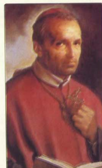
Alfonso de Liguori