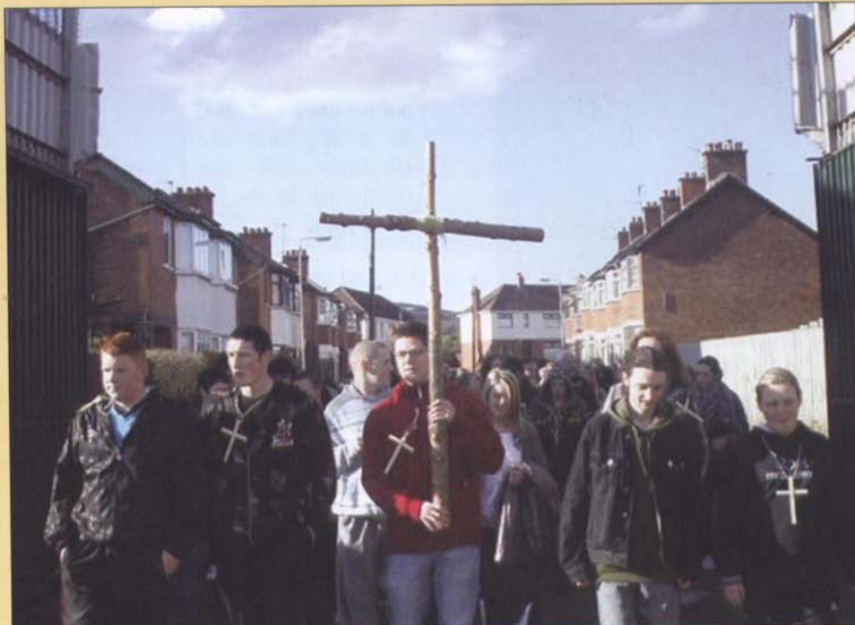
Crossing the Peace Wall: Falls/Shankill Good Friday Walk 2009

A highlight of our time together was a residential in Newcastle, County Down. Activities there included high level rope